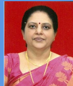
Ms Tessy Thomas DG (Aero), DRDO*